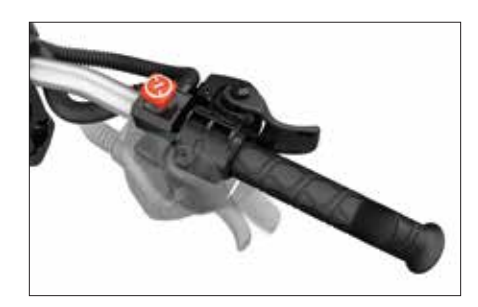
Finger throttle position Throttle block can be rotated to be used as either a traditional thumb throttle or unique finger throttle.

24 in. Super Wide Track (SWT) The industry's largest footprint provides unmatched traction and helps achieve the lowest ground pressure in snowmobiling.