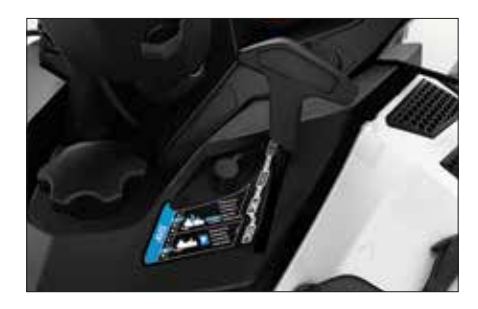
Synchromesh transmission with reverse (2-1-N-R)

RAS™ 2 front suspension A taller ski spindle, refined geometry and lighter components sharpen the sled's already precise handling and stability, especially in extreme conditions.