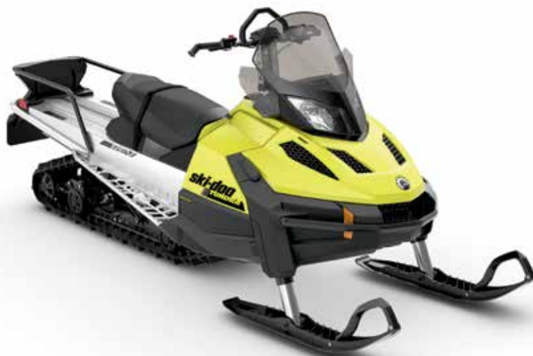
TUNDRA™ LT 550 Fan shown