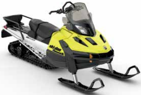
TUNDRA™ LT 600 ACE™ shown