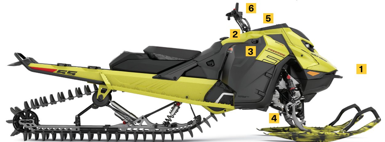
FREERIDE 165 850 E-TEC TURBO R SHOWN

The most powerful factory-built 2-stroke turbocharged engine in snowmobiling. Its instant response cranks out a full 180 HP up to 8,000 feet of elevation. Sophisticated design keeps weight down and integrates flawlessly with the REV Gen5 chassis for maximum agility. Factory install ensures peace of mind and incredible reliability.