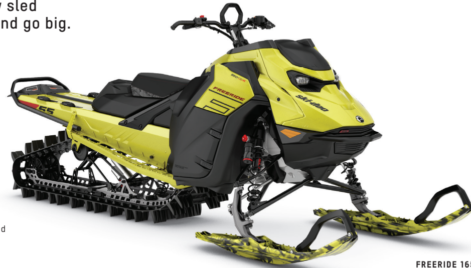
FREERIDE 165 850 E-TEC TURBO R SHOWN

Extreme capacity deep snow sled built to live large, live free and go big. The Freeride is stable and predictable at higher speed in variable snow conditions, including bigger bumps.