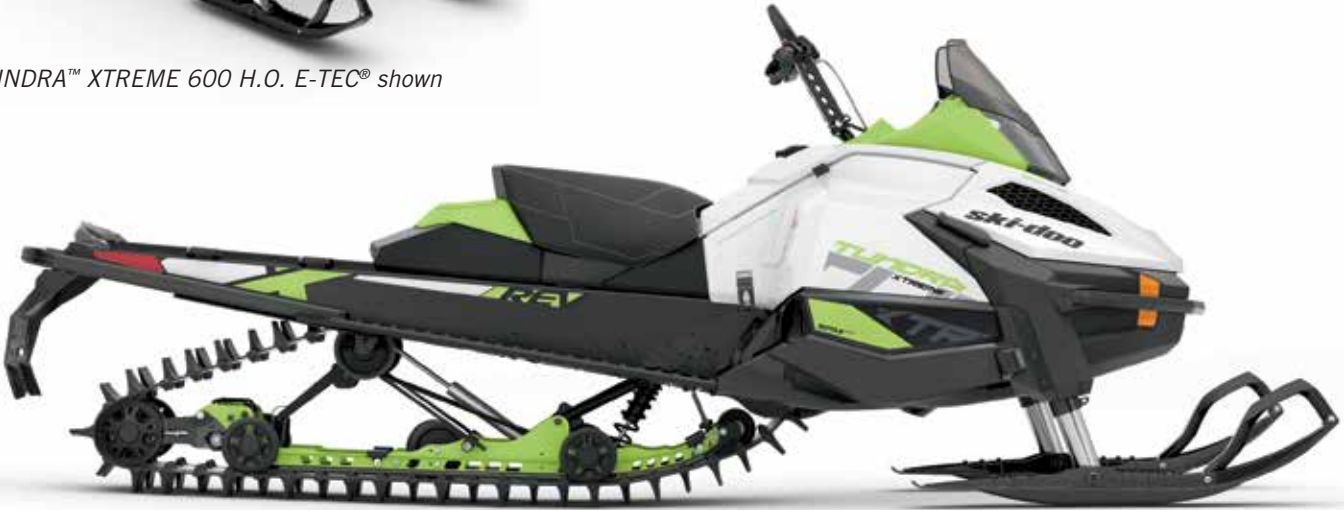
TUNDRA™ XTREME 600 H.O. E-TEC® shown