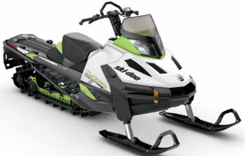
TUNDRA™ XTREME 600 H.O. E-TEC® shown