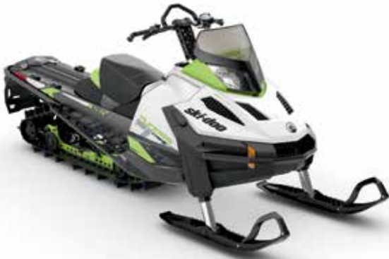
TUNDRA™ XTREME 600 H.O. E-TEC® shown