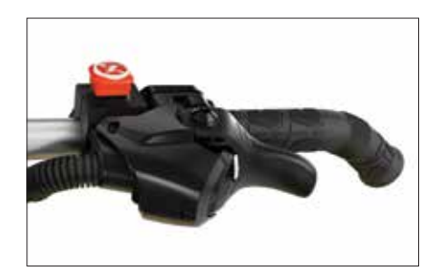
iTC™ with ECO® mode

This 62-hp in-line twin EFI 4-stoke is the most fuel-efficient snowmobile engine ever produced.