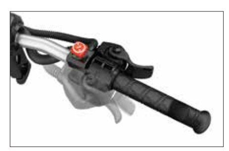
Finger throttle position

Throttle block can be rotated to be used as either a traditional thumb throttle or unique finger throttle.