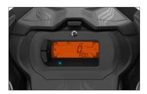
4.5-in. digital display

Intelligent Throttle Control (iTC™) throttle-by-wire technology includes three shift-on-the-fly driving modes (Sport, Standard, ECO®).