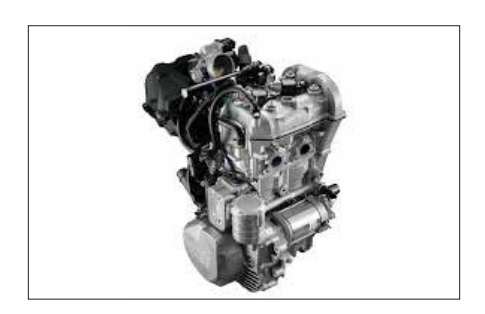
Rotax® engine 600 ACE™

Throttle block can be rotated to be used as either a traditional thumb throttle or unique finger throttle.